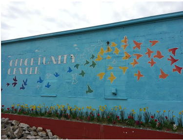
Stewpot Opportunity Center mural

In this module we dive a little deeper into the nuances of peer review. The peer-review system has been the subject of much debate. In this module we will take a cursory look at some of the opportunities that peer review affords and the challenges it presents.