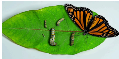
Stages of monarch development – caterpillar and butterfly

In this final module you are asked to generate even more documentation of your peer-review values and positionality and then to put your values into practice. You will be asked to reflect on your values, concerns, and