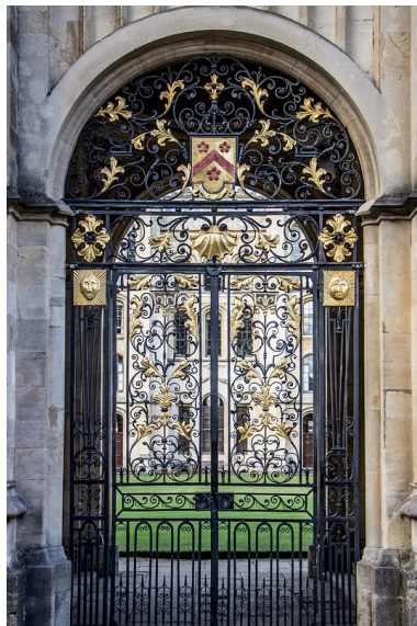
All Souls College, Oxford, England

Social power structures also come into play in peer-review work. In their chapter, “Conceptualizing Structures of Power,”