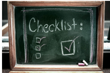
Checklist written on a chalkboard

This module builds on the activities and the thoughts you surfaced in Module 6: Librarians and Peer Review. This penultimate module of this course focuses more heavily on activity and exercises than intaking new information, and