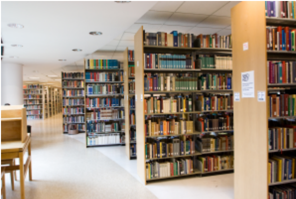
Book stacks

all material can be put on course reserves by using the course reserves request form .