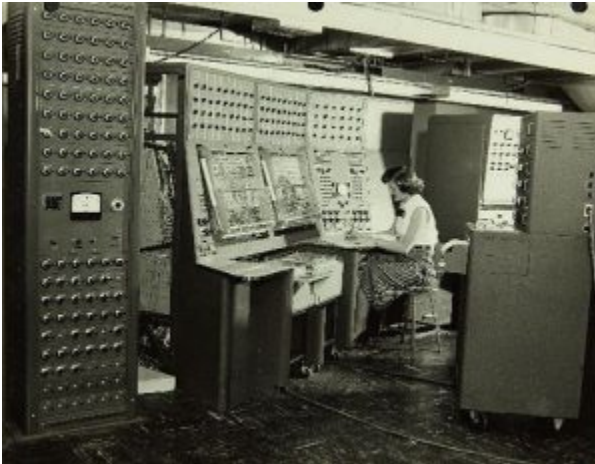
Consolidated/Convair Aircraft Factory San Diego Year: 1950

Given the current budget, in order to add new databases, we would need to cut one of similar cost in the same subject area. Databases can be ordered during the course of the fiscal year. The PSU Library prefers to run a trial to make sure databases work in our online environment prior to purchasing. To request a trial of a database, contact your subject liaison or the suggest a purchase form .