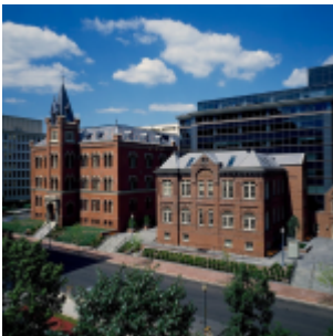
Sumner School