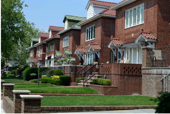
Residential home, by Artistic Operations,

Is it important to live close to your family? Why or why not