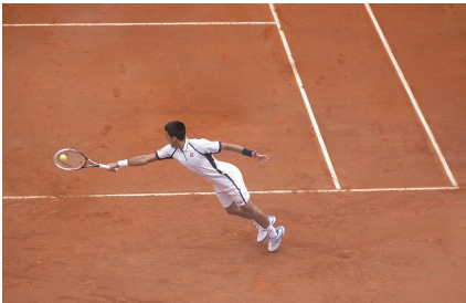
Tennis

Partner B: Agree or disagree with your partner using the phrases above. Then switch roles for statements #5-8.