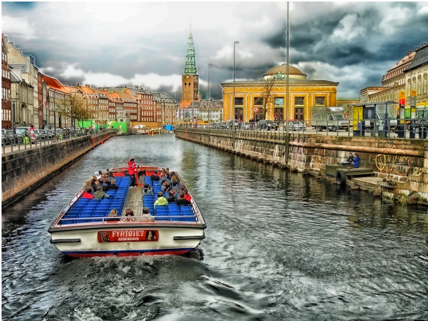
Copenhagen, Denmark