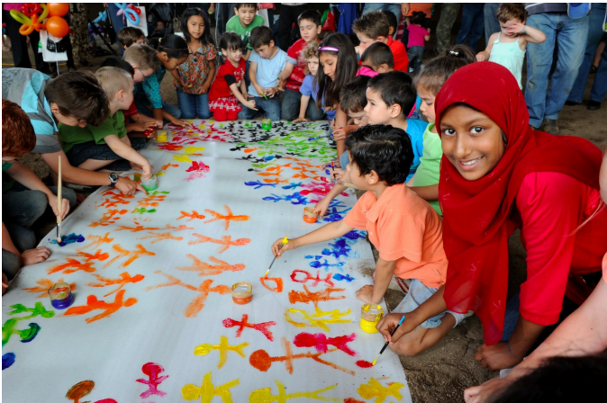
Harmony Day