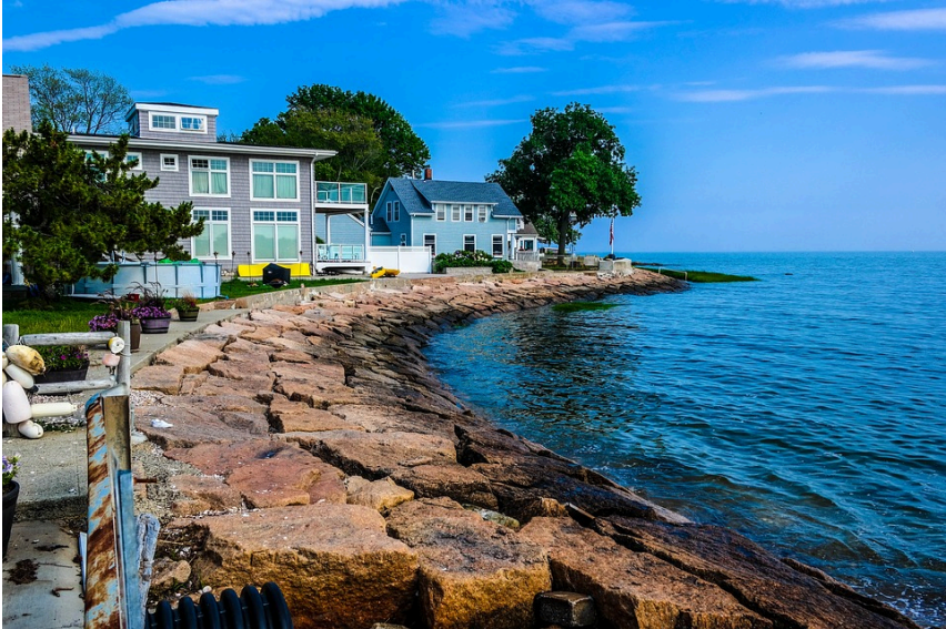
Beachfront house

Imagine you are buying the house with your partner. Compare your lists and choose the most important 3 qualities. You must agree.