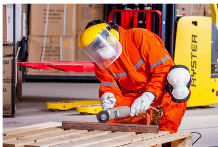
Welder, by Voltamax, CC0