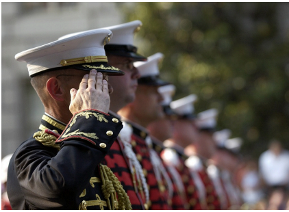
Soldiers