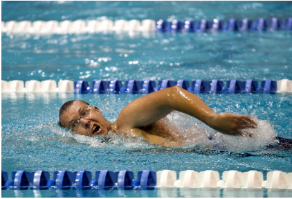
Swimmer, by Skeeze, CC0

Question: Do you prefer tennis or swimming? Why? It is important to know how to agree or disagree with someone or something. In English, there are some easy phrases you can use: