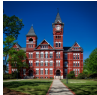
Samford Hall

Which university will you choose to attend?