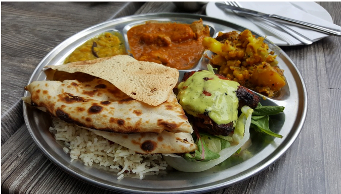
India