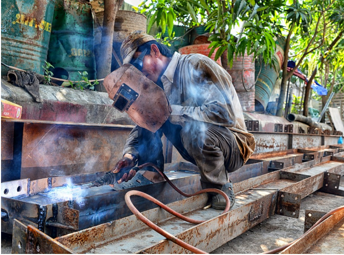
Welder