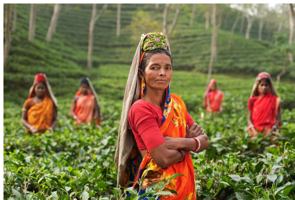
Tea Field, by Unsplash, CC0